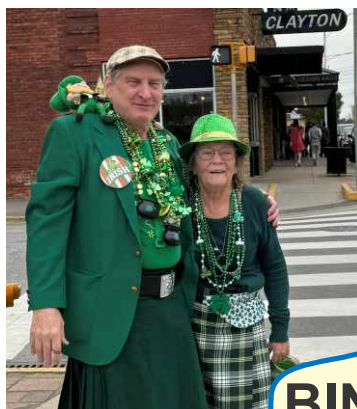
CCAA attendees do not play around when it comes to celebrating St. Patty's Day!