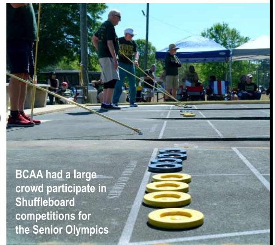
BCAA had a large crowd participate in Shuffleboard competitions for the Senior Olympics

LUNCH BUNCH May 17 @ 10 Miniature Golf dates: June 21 @ 10 Bowling