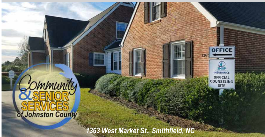
1363 West Market St., Smithfield, NC

*This institution is an equal opportunity provider and employer.